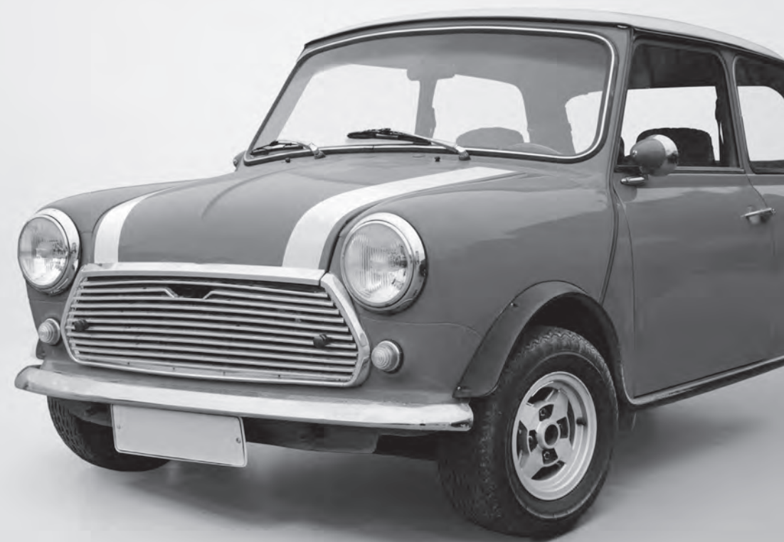
Original Mini Cooper

The Sixties was the decade in which design definitively established itself as a force that moved all strata of society, it was all about looking forward to the future, fresh ways of thinking and unbelievable creativity. From geometric shapes to neo-organic, psychedelic styles, it was a period defined by experimentation, new materials, and alternative ways of visualising.