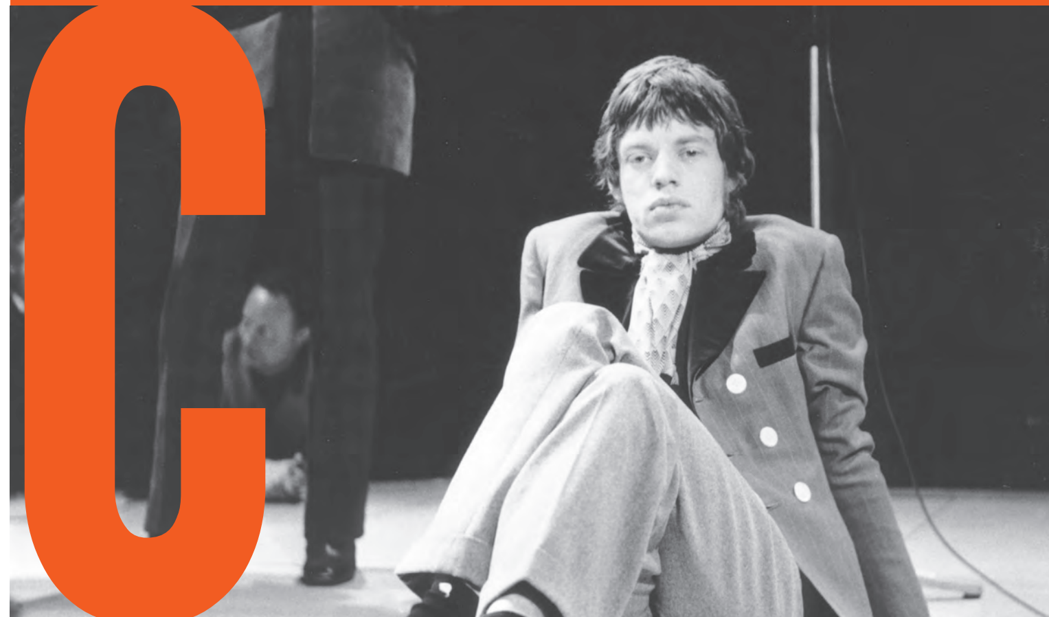
Mick Jagger, The Rolling Stones