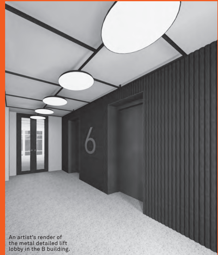
An artist's render of the metal detailed lift lobby in the B building.