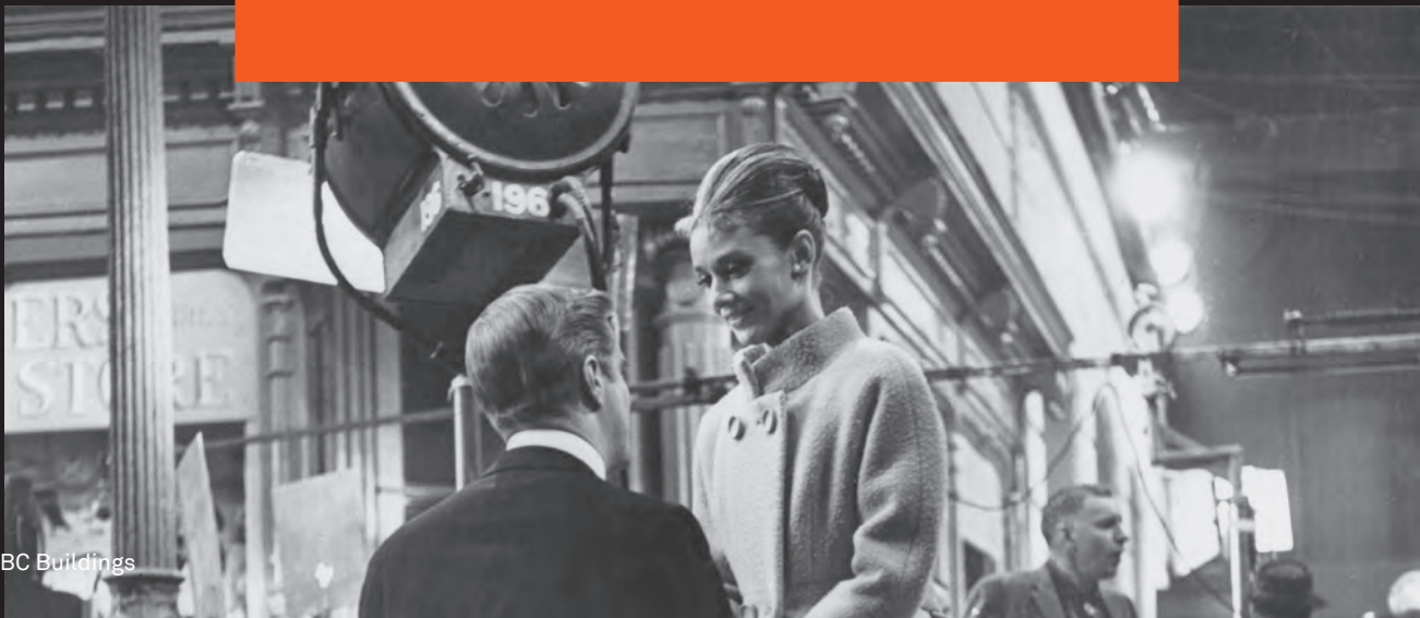
The ABC Buildings