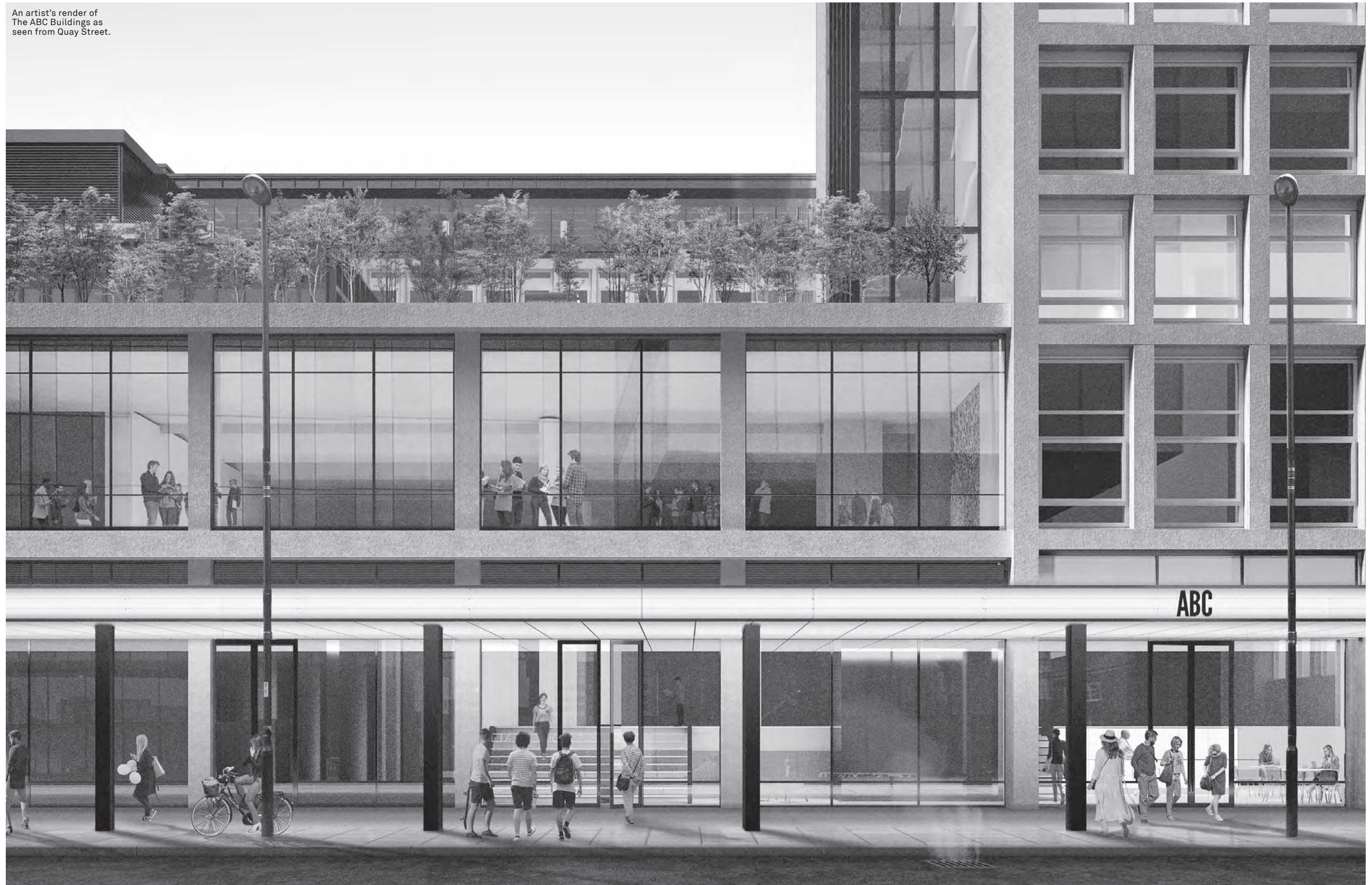
An artist's render of The ABC Buildings as seen from Quay Street.